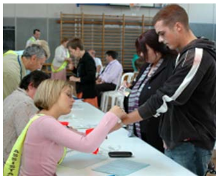
Rest Centre Registration